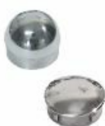
End Cap "Dome" AISI 316 [To suit 1" / 1.5" / 2" tube]