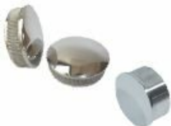
End Cap "Self Grip" AISI 316 [To suit 1.5" / 2" tube]