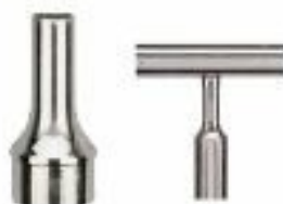
Post Reducer "Tapered" AISI 316 [Suit 1.5" / 2" tube]