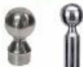
Ball Type Joiner "Cap" AISI 316 [To suit 2" tube]