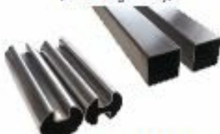
Square Satin Finish 2" AISI 316 [6 mtr lengths only]